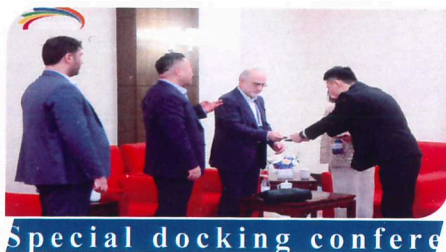
Special docking conference