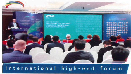
International high-end forum